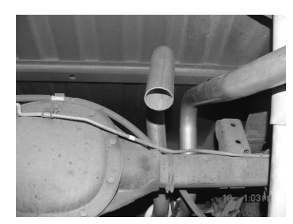
INSTALL DRIVERS SIDE FRONT TAILPIPE # D INTO MUFFLER 1-1/2" TO 2". USE CLAMP # I AND ATTACH IT TO THE MUFFLER. DO NOT TIGHTEN.

INSTALL HEADPIPE # A USING BOLT KIT # N AND # K GASKET. AND ATTACH TO THE STOCK FLANGE. DO NOT TIGHTEN.